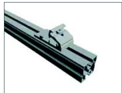
② Click in!