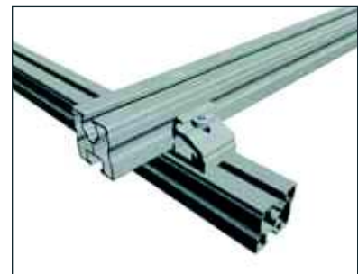
③ Position the rail and bolt together from above.

Contrary to its predecessor , the Rapid cross connector (item no. 129063-000) is delivered completely pre-assembled, thus keeping the assembly effort to a minimum.