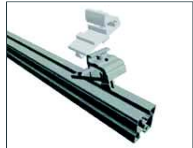
① Hook in laterally and twist.